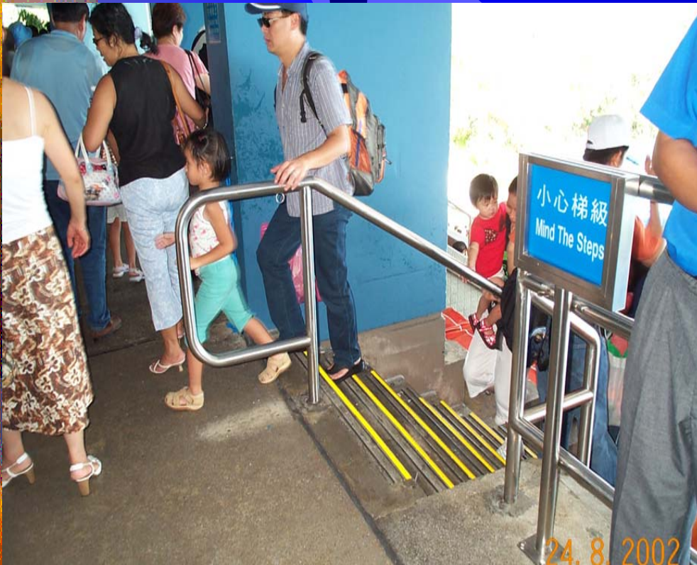
Non-slip Reflective Strips