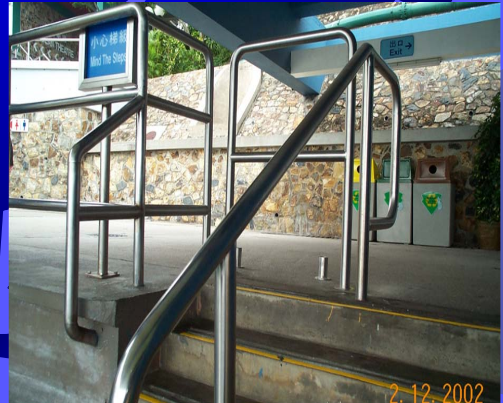
Stainless Steel Gate for Stair Clearance